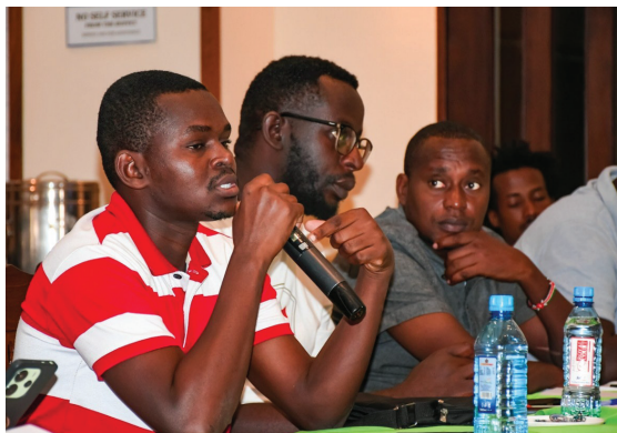
A section of Kenyan Journalist during a training on accurate, evidence-based and ethical reporting on statelessness held in Mombasa, Kenya.

Journalists' Training (Mombasa, Kenya | 31 December 2025): In December 2025, the Eastern Africa Nationality Network (EANN) convened a one-day training for journalists in Kenya to strengthen informed, accurate and ethical reporting on statelessness and its impacts. The training enhanced participants' understanding of statelessness and its impacts and strengthened reporting accuracy by clarifying relevant legal and policy frameworks and how these apply in practice.